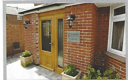
Southfield Dental Practice